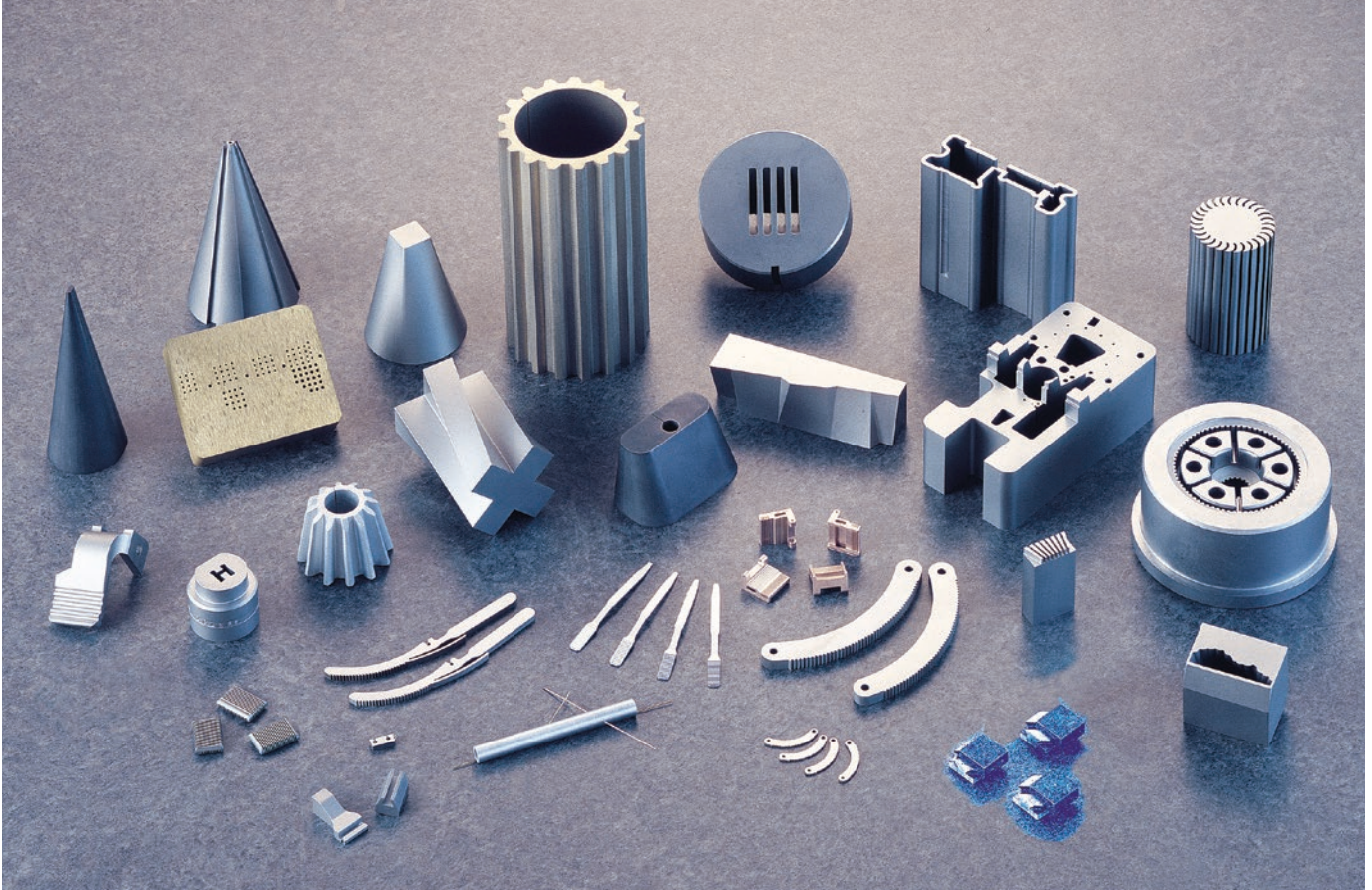
XACT Wire EDM Sample Parts

It has grown, like XACT in Wisconsin has, to service customers nationally. To provide the best service, each facility has its own group of customers. When asked about their work type, Jason indicated they work for many different and diverse industries. Their sweet spot tends to be work that must be shipped on time and generally requires high precision. It is ideal when work arrives ready to load into the Wire EDM with no additional machining processes required. If additional work is needed, it is by no means a deal breaker, but each situation is considered on a case-by-case basis. Depending on the required additional work, they may do it in-house with high-speed Small-Hole EDM or send it to one of their outsourcing partners.