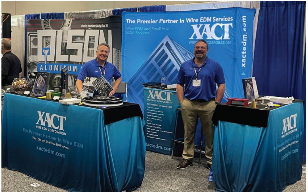
XACT Wire EDM Booth Design-to-Part Show, Schaumburg, Illinois