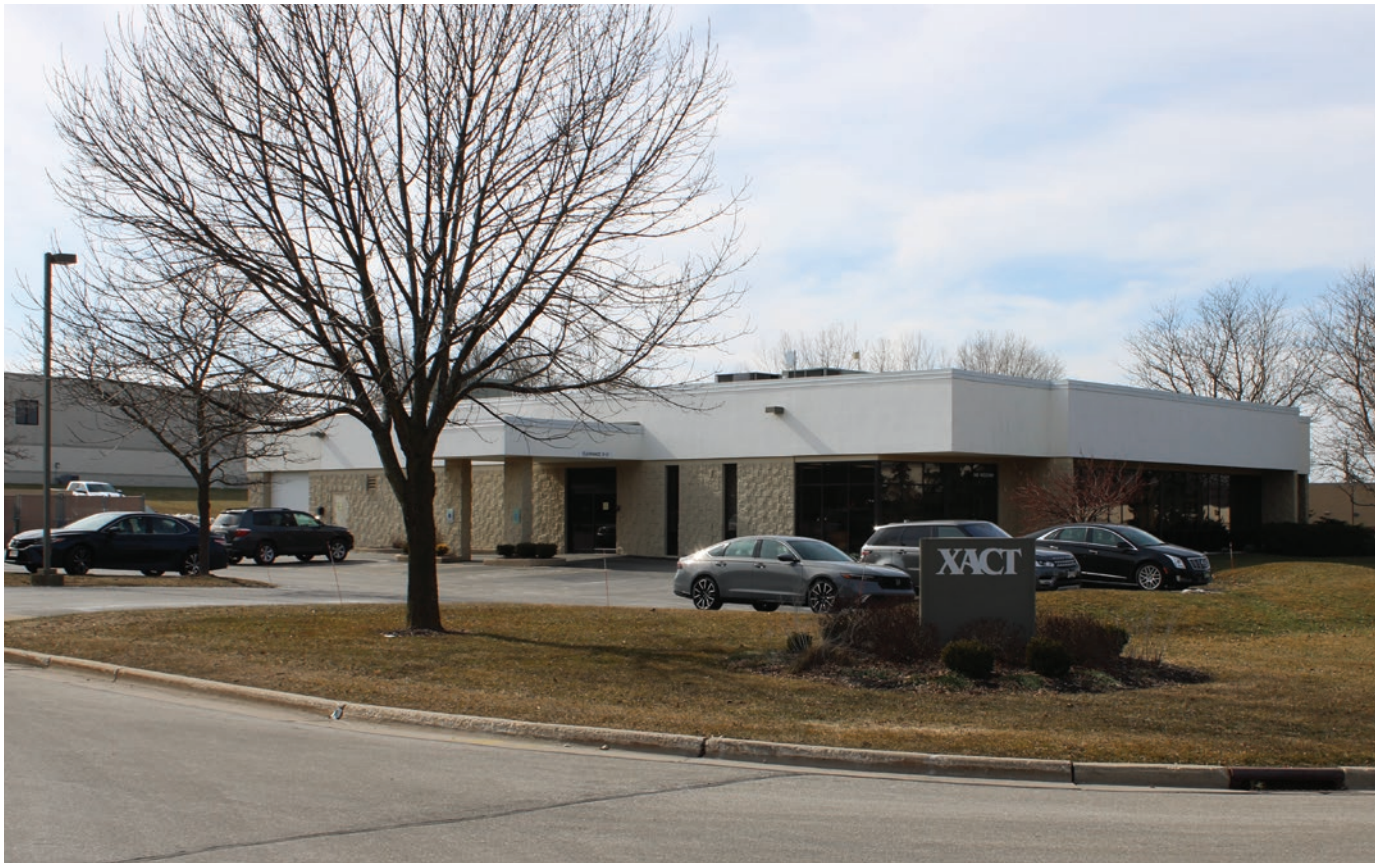
XACT Wire EDM Headquarters Waukesha, Wisconsin